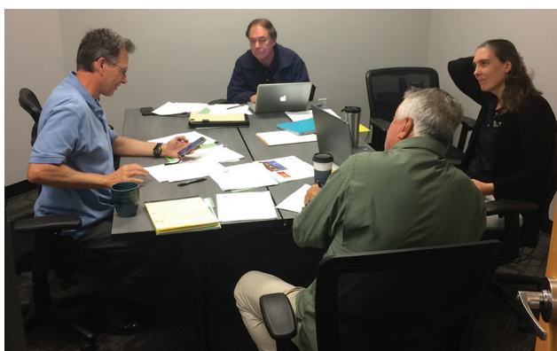
One of many GCS staff meetings working towards accreditation

Behind the scenes, a lot of effort has been exerted by the GCS staff to complete all that is necessary to renew our accreditation from the federally recognized DEAC (Distance Education Accrediting Commission). It is required every five years. It's really a year-long process that will culminate in a visit to our Charlotte offices by DEAC members this coming January. Your prayers are appreciated not only for a good outcome of being renewed but